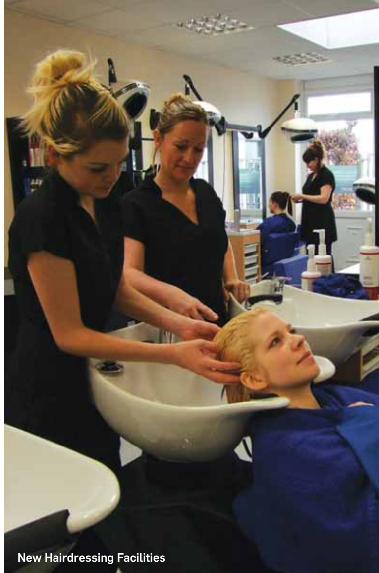
New Hairdressing Facilities

“I chose to study at Holsworthy Skills centre because I can walk here from home so no long bus journey, now that you have to pay for buses it’s also a cheaper option. This is my second year here I’m doing the Certificate in Hairdressing Services Level 1 as well as a number of other modules. The Hairdressing facilities are brilliant, I get to be with friends and learn something new.”